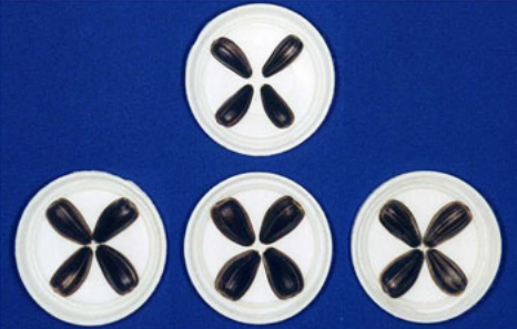
Figure 6: Seed size and seed coat color of line 2574 R (left) and mutant line 12003 R (right)