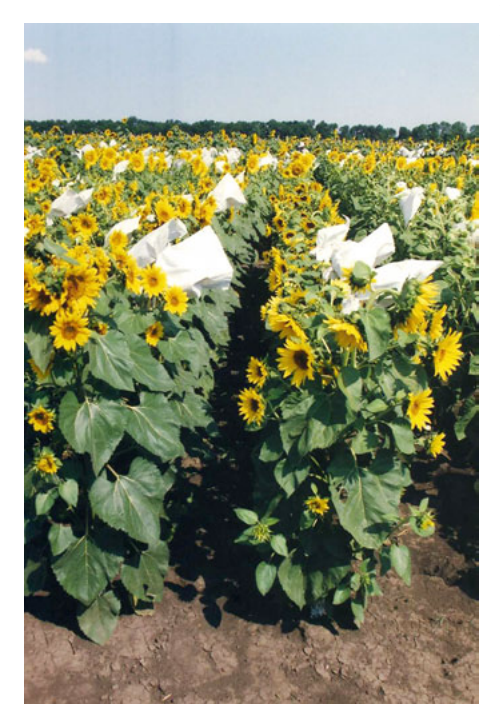
Figure 1: Genotype RHA-857 R (left) and mutant line 106 R (right)

As a results of continuous and individual selection new mutant R and B lines