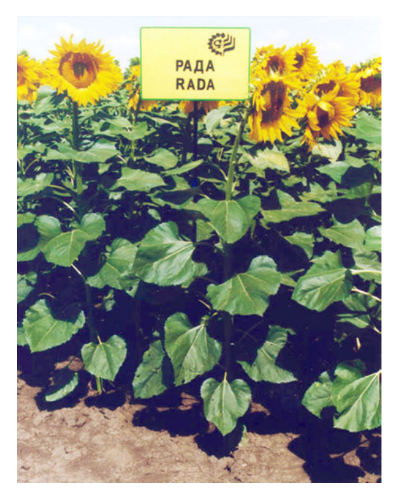
Figure 9: Hybrid "Rada" developed from the crossing 2607 A \times 12002 R

Hybrid Rada considerably exceeded the average standard of seed yield (the Bulgarian commercial hybrid Albena and French commercial hybrid Diabolo) by 2.3-7.2%.