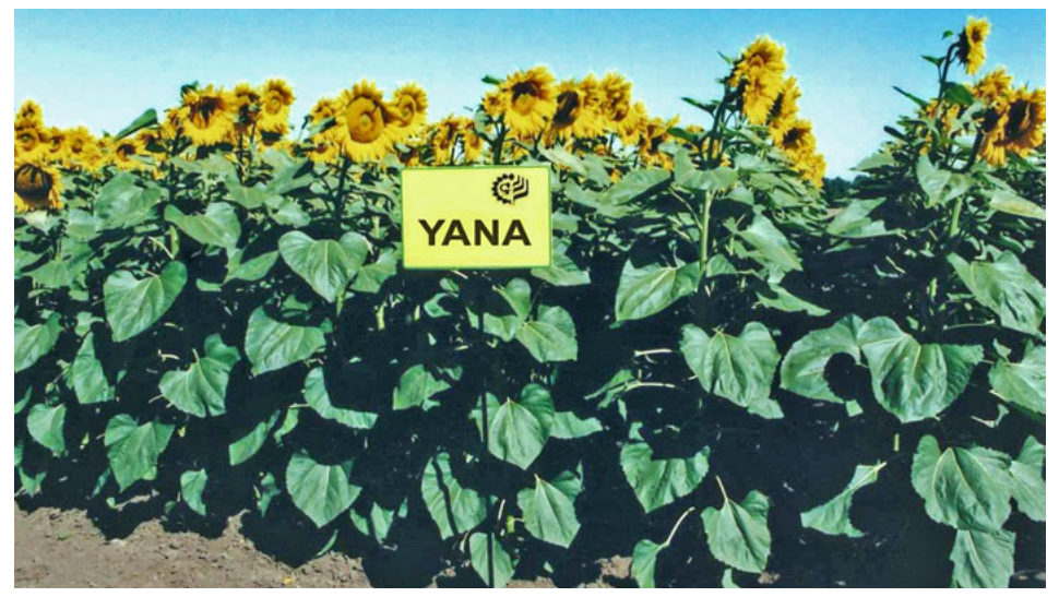
Figure 10:Hybrid "Yana" developed from the crossing 2607 A imes 12003 R

Prograin Genetique. The hybrid considerably exceeded the average standard of seed yield (French commercial hybrids Prodisol, Allstar and Melody) by 3%.