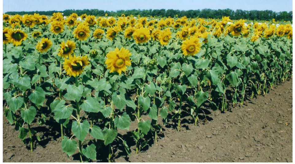
Figure 8: Hybrid "Goryanin" developed from the crossing 4558 A imes 12004 R

After long individual selection mutant lines 12002 R, 12003 R and 12004 R were developed and tested for their combining abilities. The results from three-year testing of lines 12002 R, 12003 R and 12004 R revealed very good combining abilities in hybridization. The line 2607 A and 4558 A (sterile analogues of the Bulgarian inbred lines) were used as a tester.