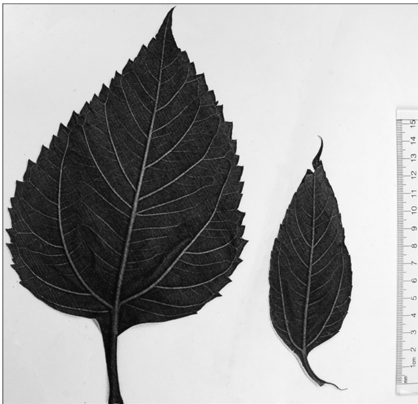
Figure 2: Extremes for leaf margin serration, leaf length and leaf width. Left: NC10-58; Right: NC10-44.

nificant difference (LSD) at the 5% level. Histograms were generated to visualize the variability of these quantitative characters. The repeatability of the observations made on each accession in different years was assessed by checking the identity of observations for rated characters or by calculating the linear correlation coefficient for quantitative characters for 158 accessions. The passport data and characterization results for each accession will be published on the PGRC website GRIN-CA ( http://pgrc3.agr.gc.ca/ ).