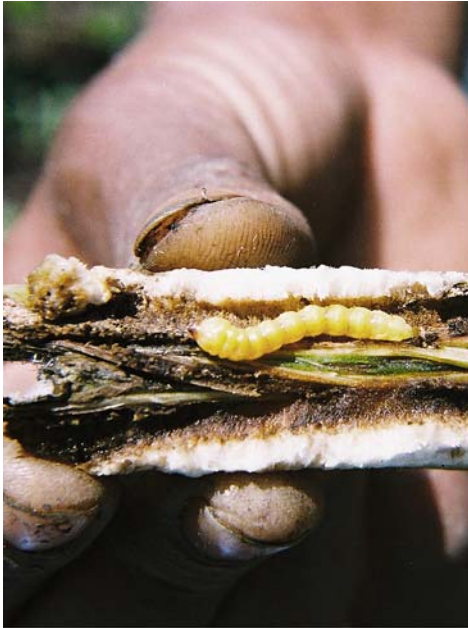
Figure 3: Grubs of the stem borer, Nupserha sp near vexator (Pascoe), in sunflower