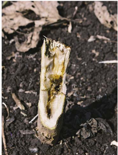
Figure 6: Finally, the grub makes an exit hole at the bottom and escapes into the soil for pupation