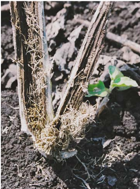
Figure 5: Severe sunflower stem damage by stem borer