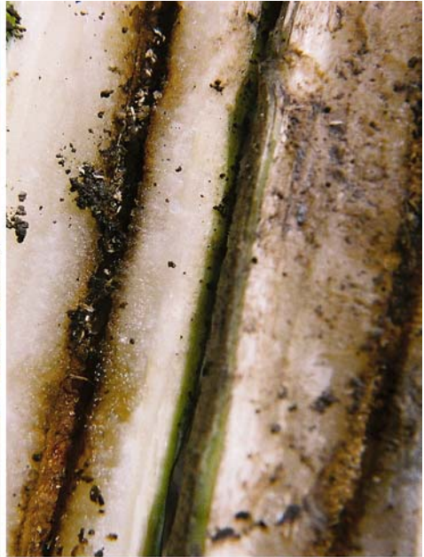
Figure 4: Grub feeds on internal pith tissue making a tunnel