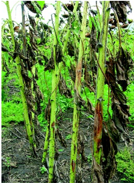
Figure 1: A frequent symptom, external stem canker evolving