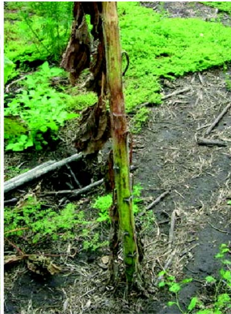
Figure 2: The stem and the plant are completely wilted