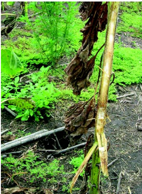
Figure 3: Longitudinal section of the stem showing Phomopsis affects