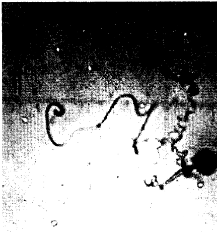
Figure 1: Competitive pollen parent R X 13 with high pollen germination percent and tube growth in sunflower

The pollen competitive influence in the sporophytic phase was studied in 30 F_1 's derived from crosses of the three CMS lines with the ten restorer lines. Equal pollen quantities from the restorers and the respective maintainer lines were used for crossing. The resulting 30 hybrids were planted after the head-to-row progeny method with the row length of 45 m and the spacing of 30 x 15 cm, in three replications, at RRS, Raichur, during kharif 1995. Four hundred random plants in each hybrid combination were assessed for percent fertile plants and percent sterile plants. The data were statistically analyzed using factorial randomised block design (Snedecor and Cochran, 1967).