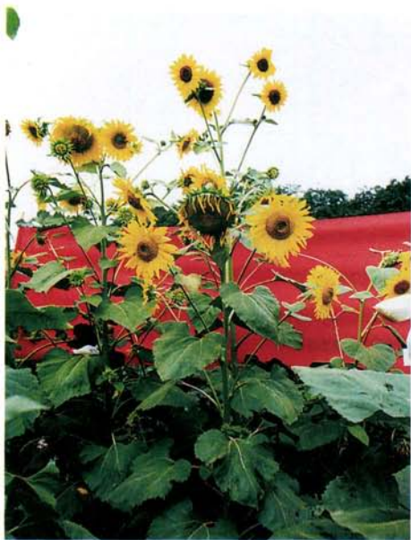
Figure 1. BC_1 plants, [Peredovik x H.divaricatus ] x HA 300