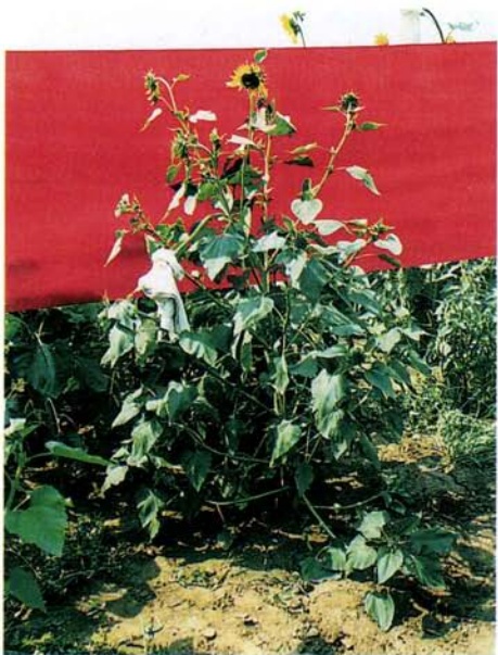
Figure 3. F_2 plants, H.annuus (2607) x H.mollis