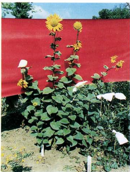
Figure 4. F_1 plants, H.annuus (1234A) x H.mollis